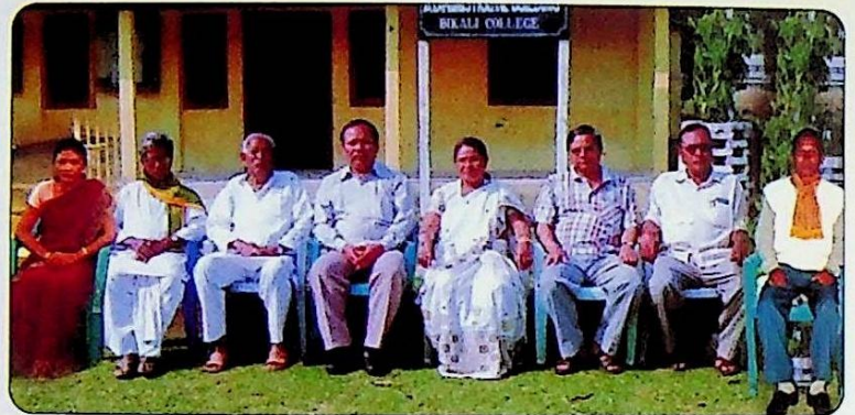
Governing Body, Bikali College