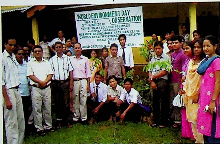
Plantation drive on world Environment Day