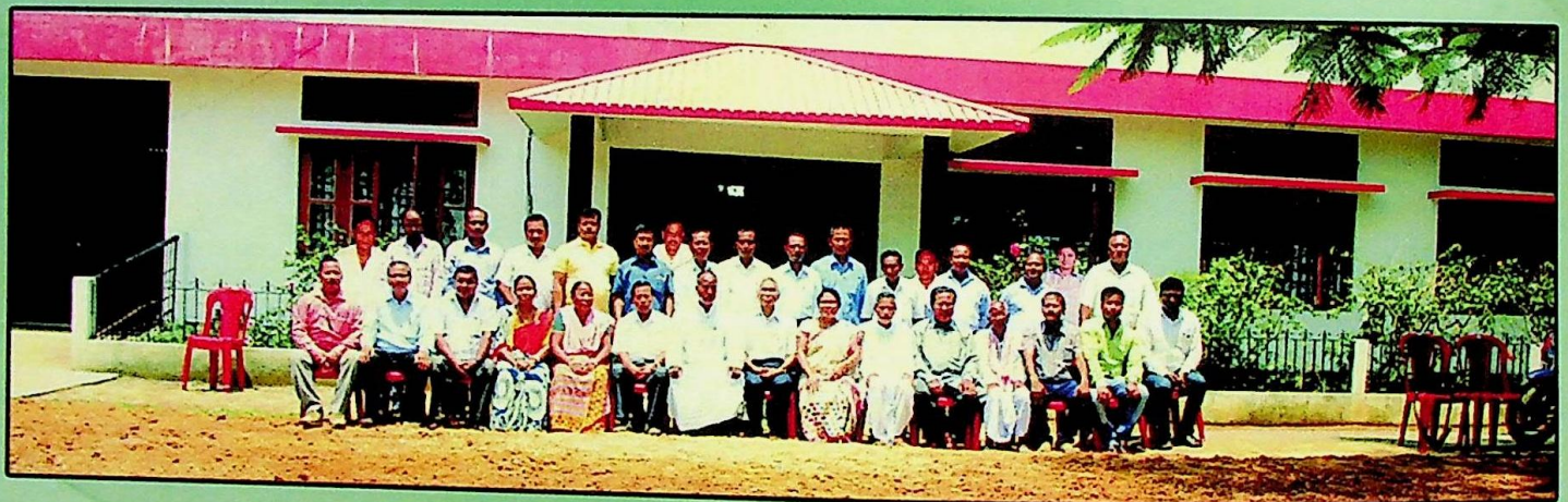
Members of Science Committee